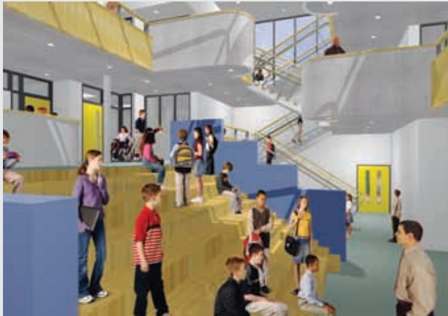
View of amphitheatre/assembly space