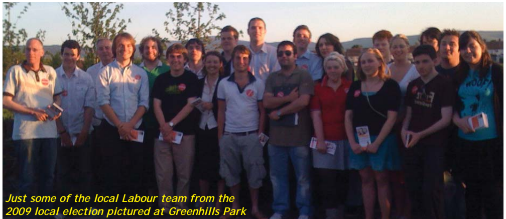
Just some of the local Labour team from the 2009 local election pictured at Greenhills Park

However, we do not believe this newsletter fits the category of 'junk mail.' We are not selling a product or service, but providing significant local news updates as well as filling an important democratic role. Hearing nothing from politicians between elections is a similarly frequent and more worrying complaint. Please contact us if you prefer to receive this newsletter by email, or not at all.