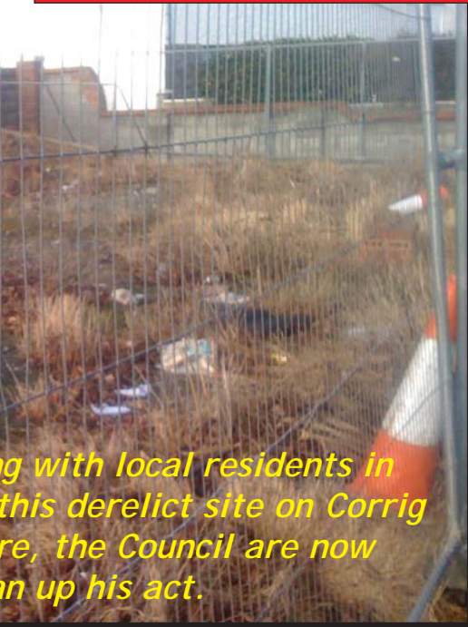
Working with local residents in this derelict site on Corrigre, the Council are now pushing up his act.