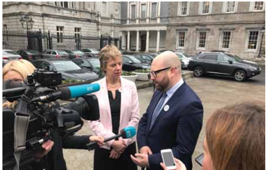
Senators Ged Nash and Ivana Bacik launch Ged's Bill for a State apology to and exoneration for LGBT citizens who were convicted of certain offences prior to the decriminalisation of homosexuality.

This is an important milestone on the road to full equality in our society and I am hopeful that all parties will support this Bill.